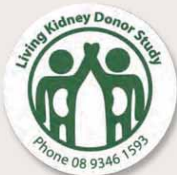
66 mm circle: 100093.