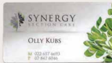
90 mm × 50 mm: 104184.