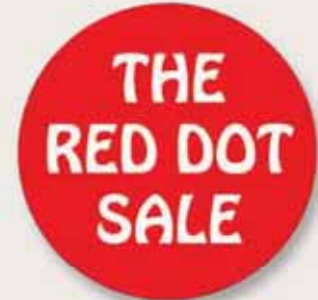
60 mm circle: 100114.