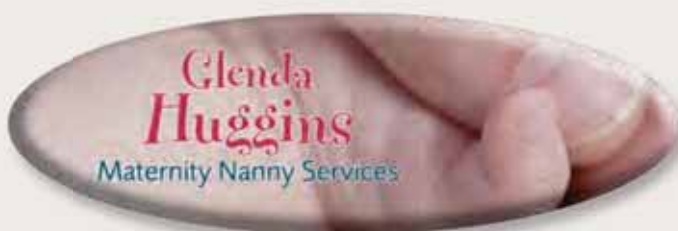
90 mm × 30 mm: 100135.