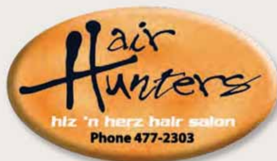
74 mm × 43 mm: 100136.