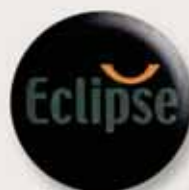
24 mm circle: 100131.