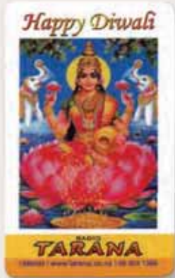
78 mm × 48 mm: 104185.