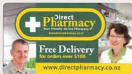
90 mm x 50 mm: 100100.