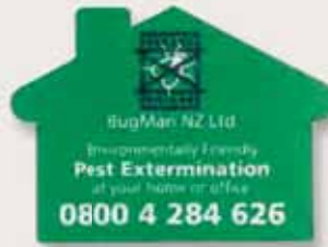
70 mm × 50 mm: 100113.