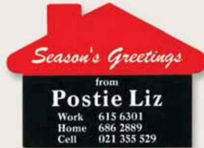
• 70 mm × 50 mm: 100091.