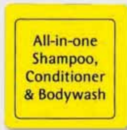
50 mm × 50 mm: 100111.