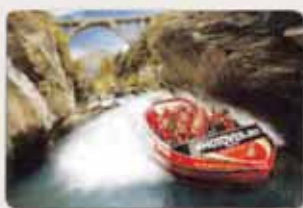
60 mm x 40 mm: 100097.