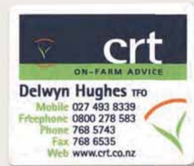
70 mm × 60 mm: 100094.