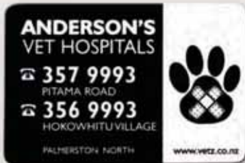
60 mm × 40 mm: 100089.