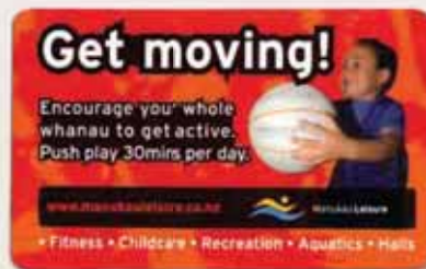
78 mm x 48 mm: 100098.