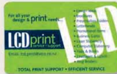
78 mm × 48 mm: 100116.