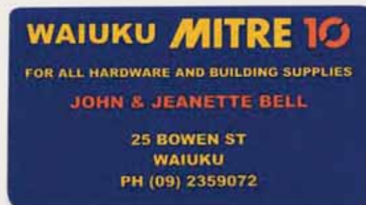
90 mm × 50 mm: 100096.