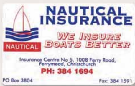
78 mm × 48 mm: 100092.