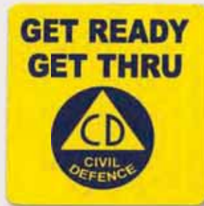
50 mm × 50 mm: 100090.